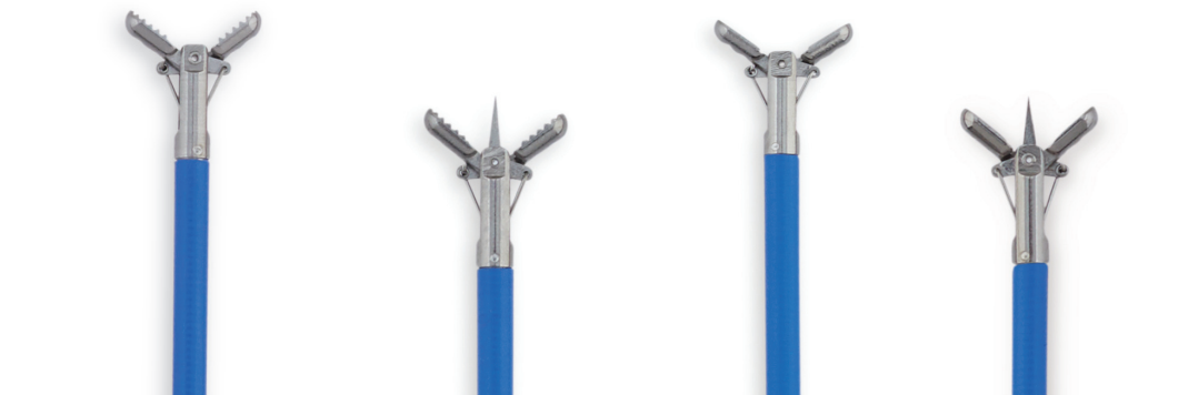
Alligator Cup Without Spike